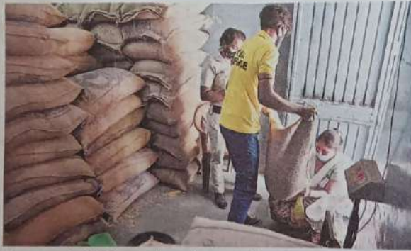
Two crore ineligible people are in possession of ration cards, drawing 6 kg of rice free or 12 crore kilos in total, per month. REPRESENTATIONAL PICTURE